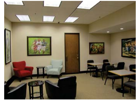
Ground Floor Cafeteria Waiting Room