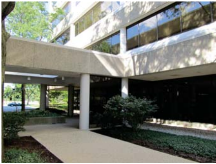
One Northfield Plaza Main Entrance