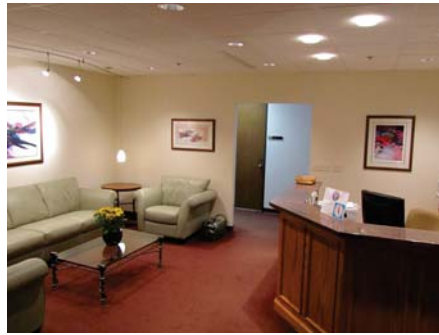
3rd Floor Reception Area